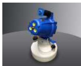
Sanosil Easy Fog